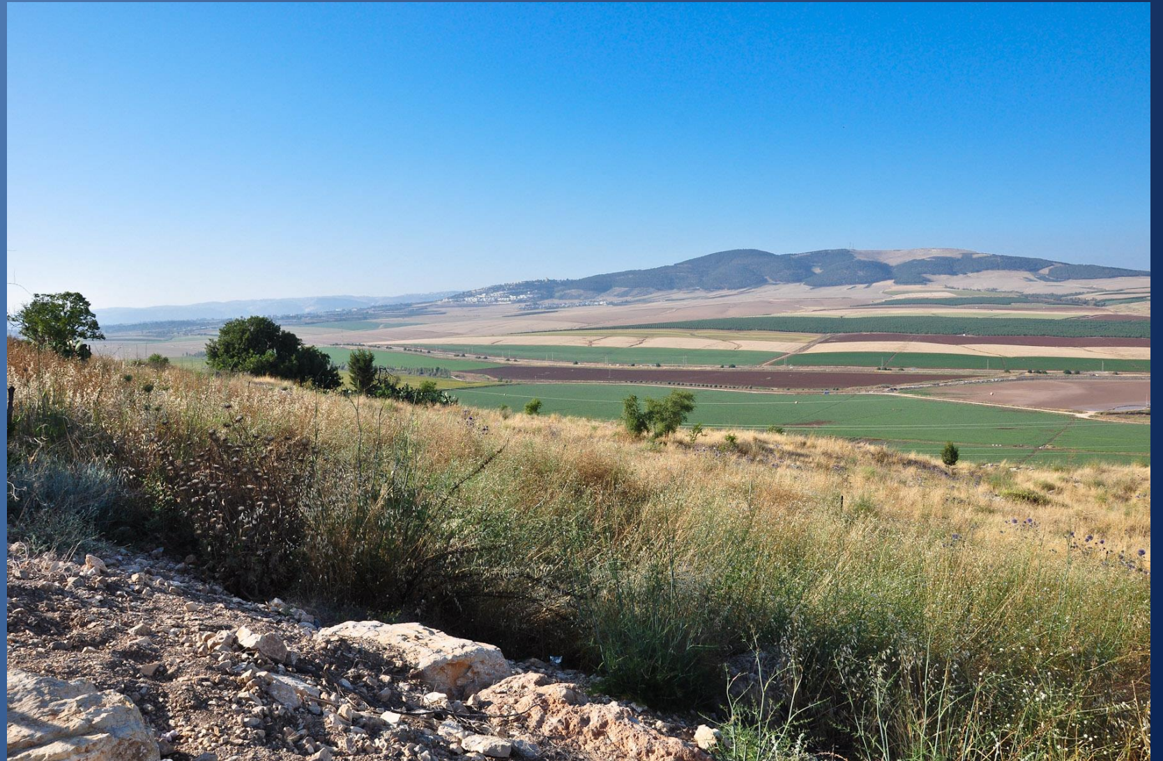
Shunem in the distance viewed from Jezreel