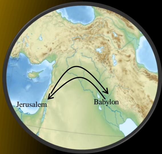
Letters across the Levant