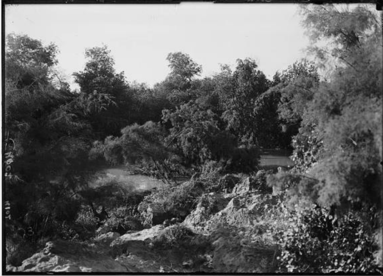
The earthquake of July 11, 1927. Jordan flow checked by caving in of the river banks. Trees thrown into midstream.