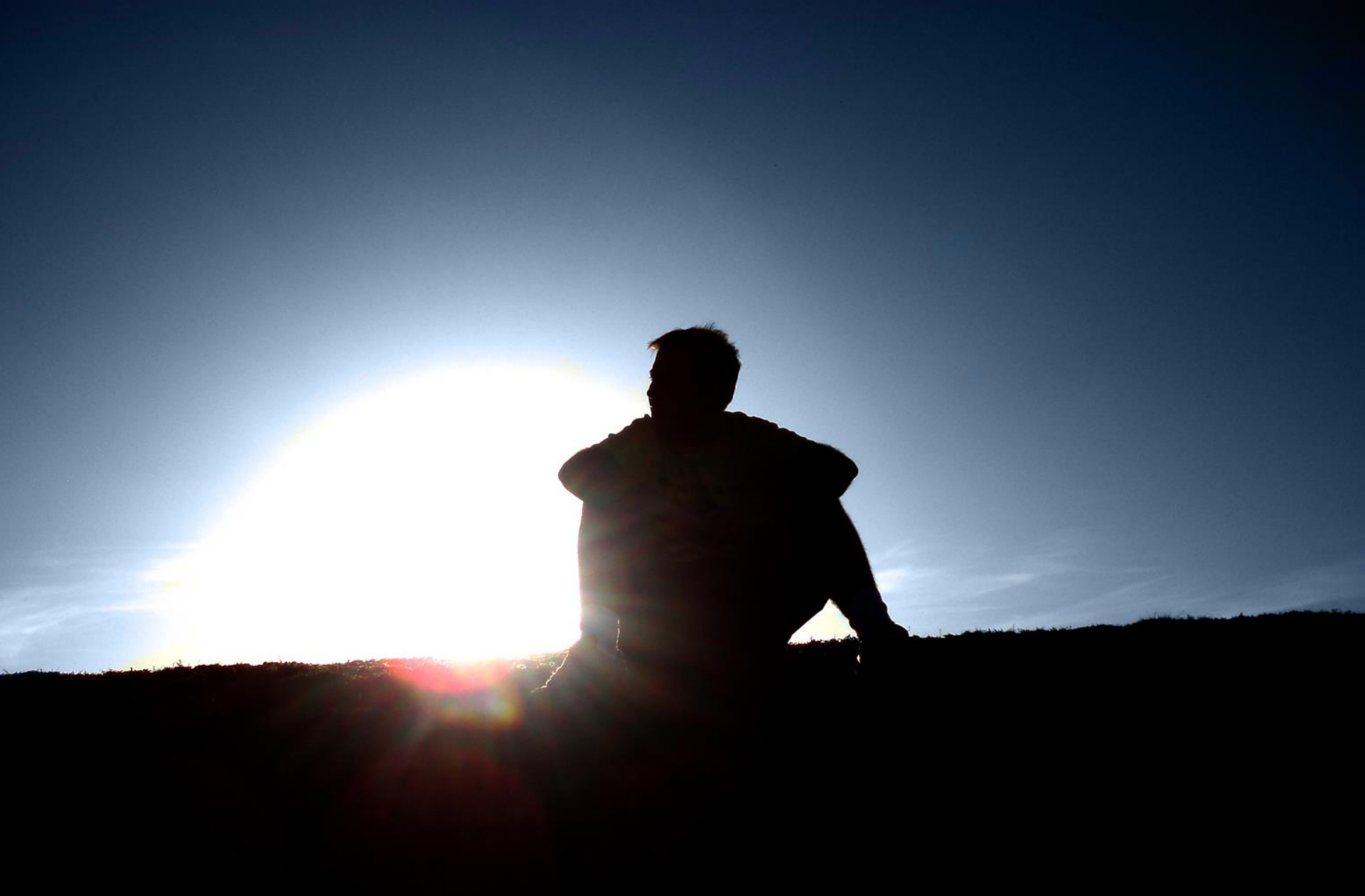
Will you abide the day of his coming?